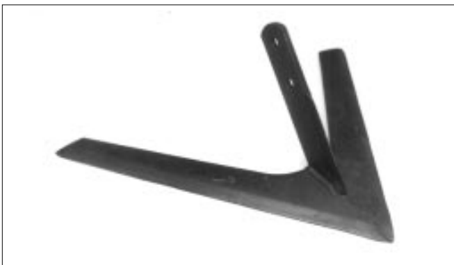
Figure 1. A smith fin is a flat sweep and is used for cultivation in southern agricultural regions.

No. In the second growing season of the experiment, yield was higher in plots cultivated at 7 than at 4 miles an hour (see Table 4). This study shows that high-speed cultivation may offer two benefits: growers can cover more acres in less time, and they may have slightly higher yields while improving weed control. For safety purposes, consider using a guidance system when cultivating larger acreages to avoid operator fatigue.